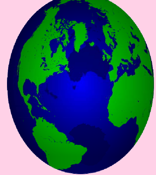
Join Hands with ABS to save our planet 'Earth'