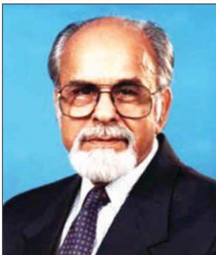
Inder Kumar Gujral