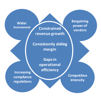
Forces' impacting retailer's marketing function

These forces impact the retailer's revenue growth, compelling them to reduce / compromise for lower margins, thus affecting its operating efficiency. It is imperative for these retailers to adopt suitable strategies to sustain growth. Against this backdrop, retailers struggle to identify and execute the critical path to profitable growth. Unfortunately, most leaders are resource constrained, and are hamstrung by a lack of actionable market intelligence.